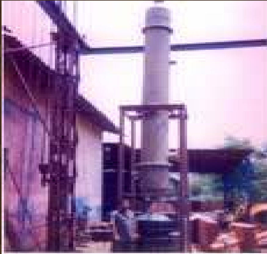
Pack Bed scrubber for Toxic Fumes