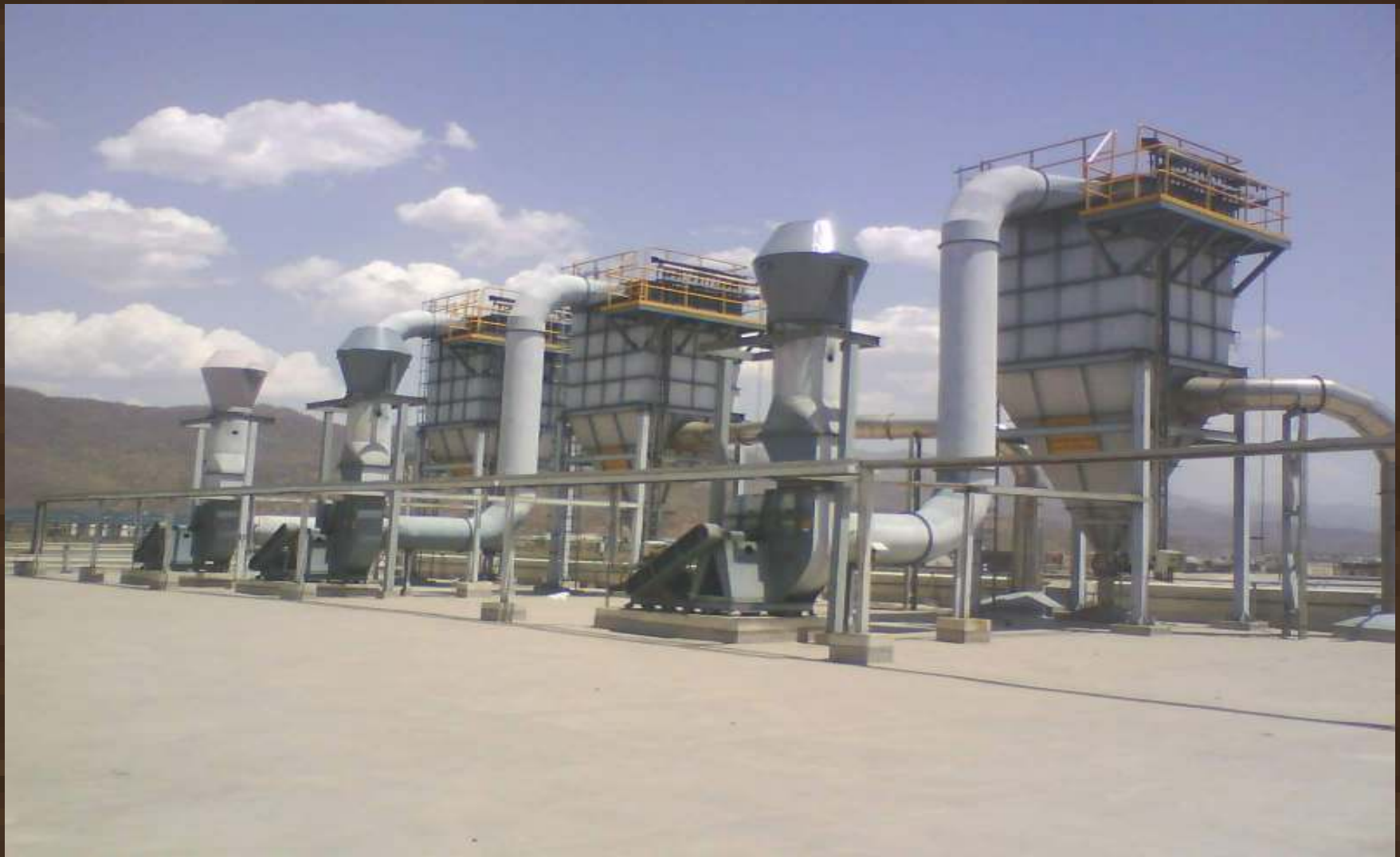
Filter with Blower Silencer