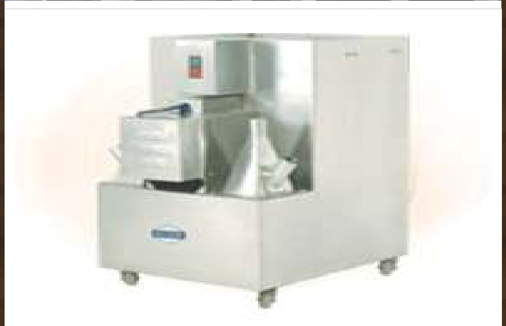
Portable Stand alone Dust Collector System