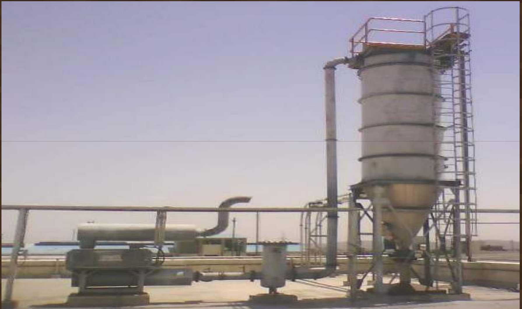
Centralized Vacuum Cleaning System